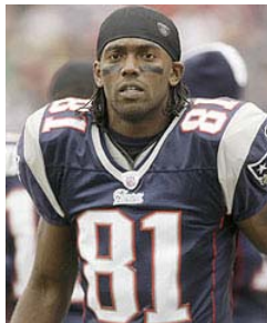
Randy Moss gets kudos from another No. 81, former Patriots and 49ers tight end Russ Francis.

I decided to call the original 81, Russ Francis, the All-Pro tight end with both the Patriots and the San Francisco 49ers. For those who don't remember, Russ was the No. 1 pick of the Patriots in 1975, played with the Patriots for six years, then went to the 49ers where he started in San Francisco's Super Bowl win over Miami in Super Bowl XIX.