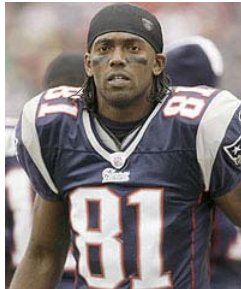
Randy Moss gets kudos from another No. 81, former Patriots and 49ers tight end Russ Francis.

I decided to call the original 81, Russ Francis, the All-Pro tight end with both the Patriots and the San Francisco 49ers. For those who don't remember, Russ was the No. 1 pick of the Patriots in 1975, played with the Patriots for six years, then went to the 49ers where he started in San Francisco's Super Bowl win over Miami in Super Bowl XIX.