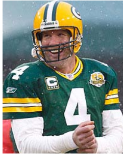
Go ahead and bring on the snow -- it's what Favre seems to be thriving on.

"In a perfect world," he said, "I'd win in Texas Stadium and we'd win the Super Bowl, but since I'm not a magician, I'll take the Giants here."